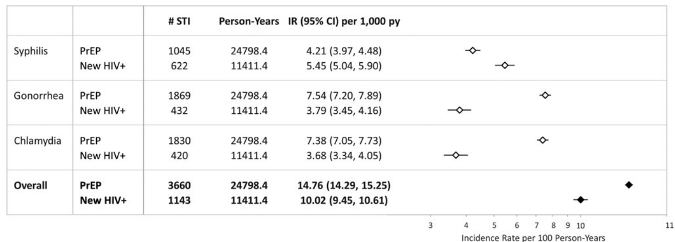
FIG. 3. STI a IRs per 100 person-years for PrEP recipients ( N = 14,598 ) versus new HIV+ individuals ( N = 3558 ). a Overall STI: new diagnosis or positive laboratory result for active syphilis, gonorrhea, chlamydia, trichomoniasis, chancroid, lymphogranuloma venereum, Mycoplasma genitalium , acute hepatitis C virus, or acute HBV during follow-up. CI, confidence interval; HBV, hepatitis B virus; IR, incidence rate; PrEP, pre-exposure prophylaxis; PY, person-years; STI, sexually transmitted infection.

Incidence of STIs have been increasing over time in the United States, with a 19% increase in chlamydia, a 63% increase in gonorrhea, and a 71% increase in primary and secondary syphilis from 2014 to 2018. 41 In 2018, the CDC reported high rates (cases per 100,000 population) of chlamydia (539.9), gonorrhea (179.1), and syphilis (10.8), but only three cases of chancroid. 41 Similarly, in OPERA, syphilis, gonorrhea, and chlamydia were the most common STIs