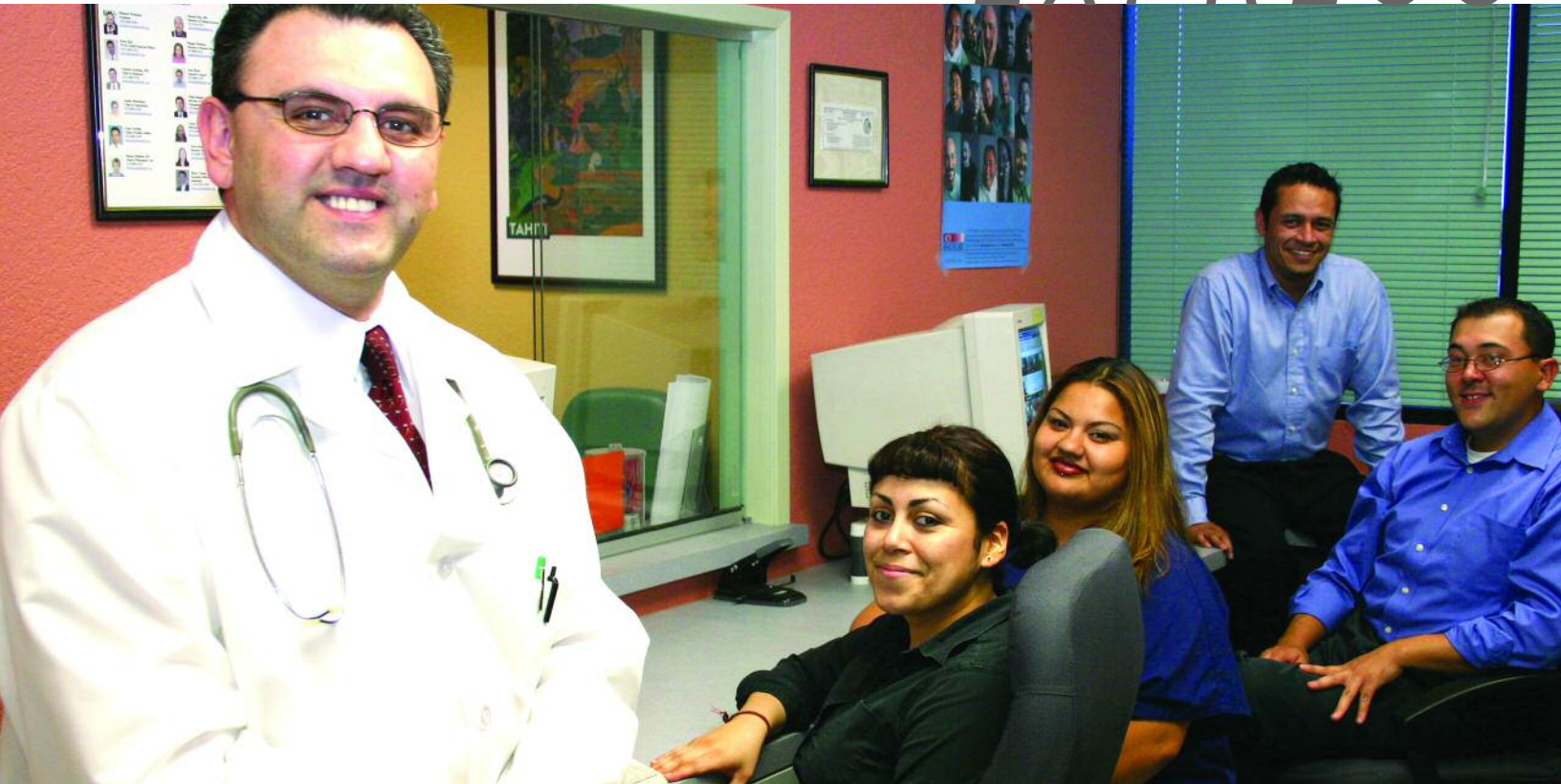
The staff at Antelope Valley is ready to greet you with a smile and to satisfy your every need.